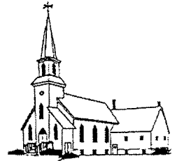
Our Savior's 2589 190th Avenue