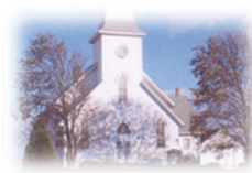
Our Savior's Church 2589 190th Avenue