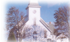
Our Savior's Lutheran Church 2589 190th Avenue