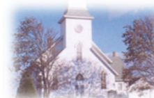
Our Savior's Lutheran Church 2589 190th Avenue