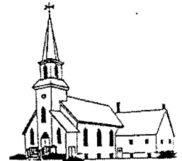
Our Savior's 2589 190th Avenue