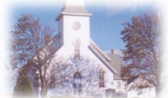
Our Savior's Lutheran Church 2589 190th Avenue