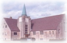
Faith Lutheran Church 505 2nd Street