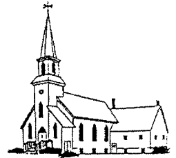
Our Savior's 2589 190th Avenue