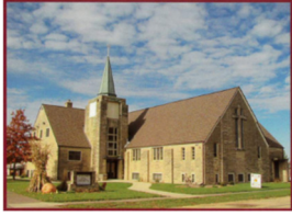
Faith Lutheran Church 505 2 nd Street Calamus, IA 52729