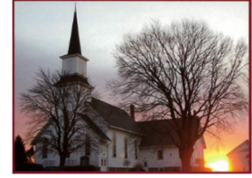
Our Savior's Lutheran Church 2589 190 th Avenue Calamus, IA 52729